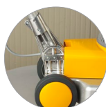
Articulation of the handle