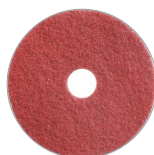
Extensive range of pads and brushes