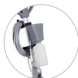
Spray electric system