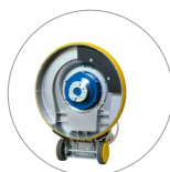
Mount for drive board and brushes