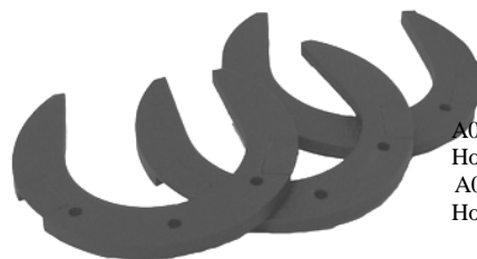
A0032-1P -- Optional 25# Horseshoe Weights (each) A0032-3p -- Optional 36# Horseshoe Weights (each)