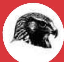
HAWK Enterprises, Inc.